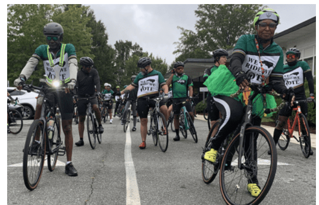
Cyclists took to the streets of Greensboro in a spirited 20-mile ride called “We Ride, We

highlighting the large number of Title I schools in Guilford County that serve low-income students. These schools stand to gain millions in settlement funds from the Leandro v. State of North Carolina case, which affirmed that every child in the state has the constitutional right to a sound, basic education.