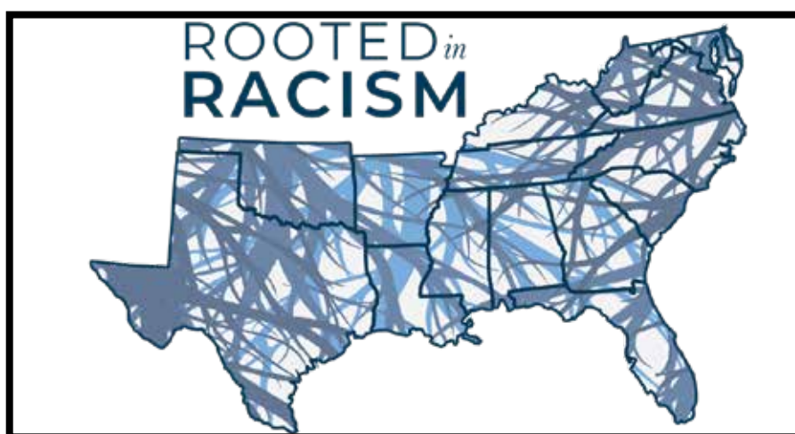
Black voter disenfranchisement remains a key fea-

ture of the racist and anti-worker Southern economic development model today.